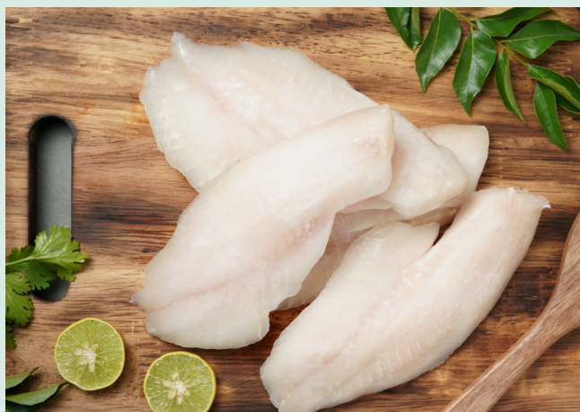
Tilapia fillet, IQF