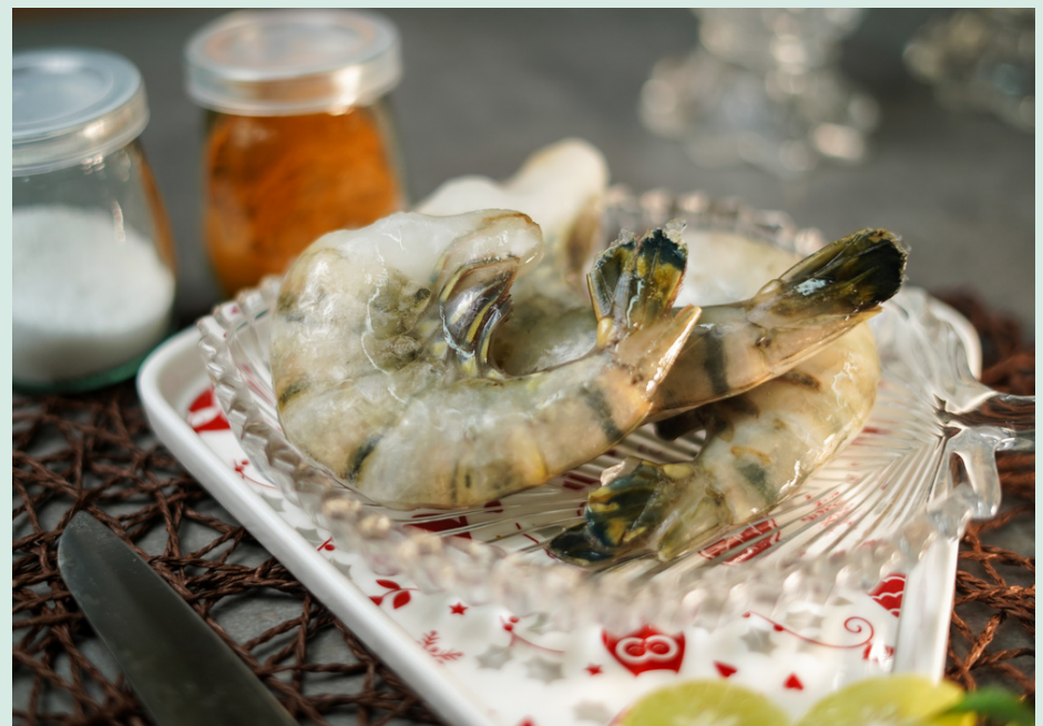
HLSO black tiger shrimp, IQF & block frozen