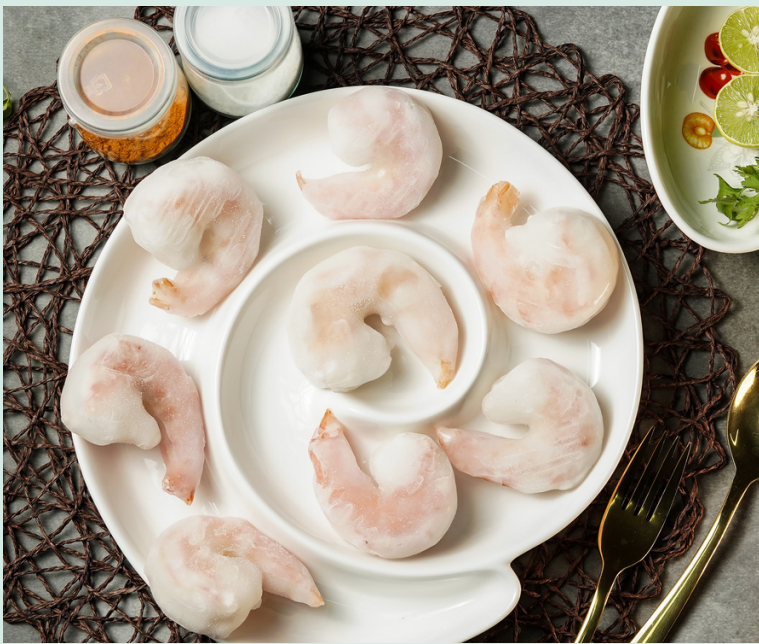
PD Vannamei shrimp, IQF & block frozen