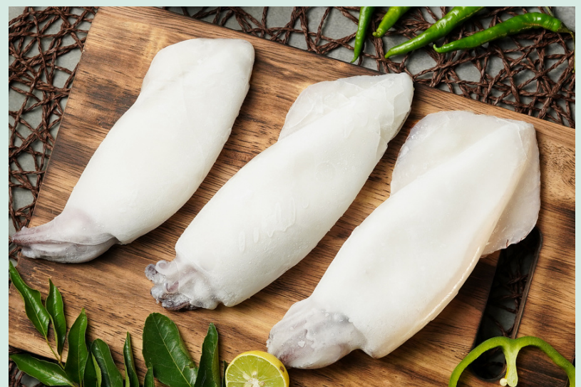
Squid whole cleaned, IQF & block frozen