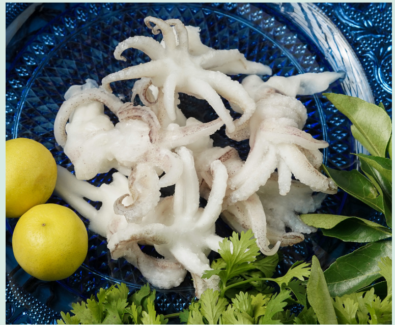
Squid tentacles, IQF