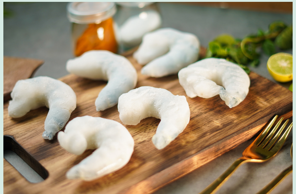
PD black tiger shrimp, IQF & block frozen