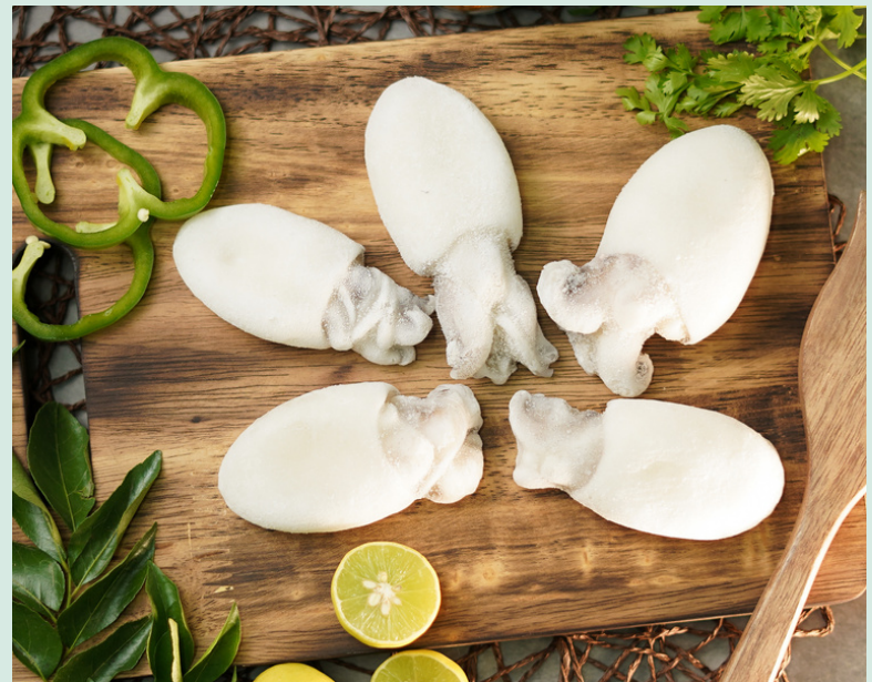
Baby cuttlefish whole cleaned, IQF