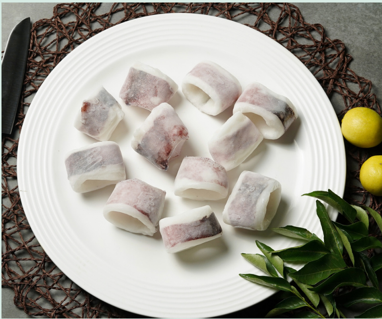
Squid rings skin-on, IQF