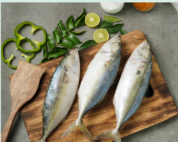
Indian Mackerel, IQF