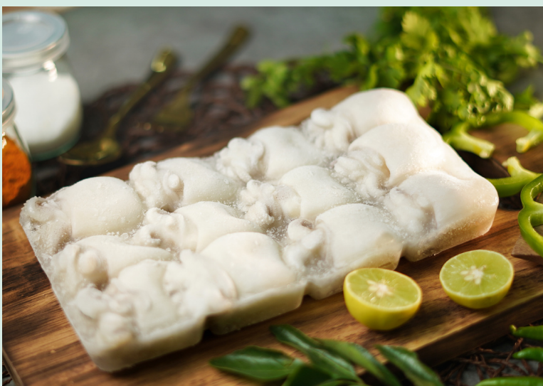
Baby cuttlefish whole cleaned tray pack