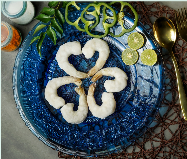
PDTO Vannamei shrimp, IQF & block frozen