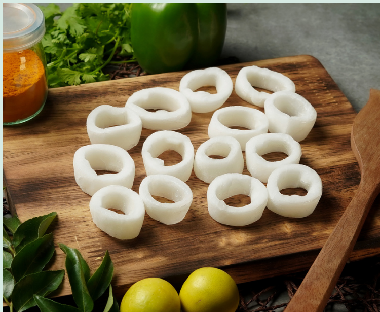
Squid rings, IQF