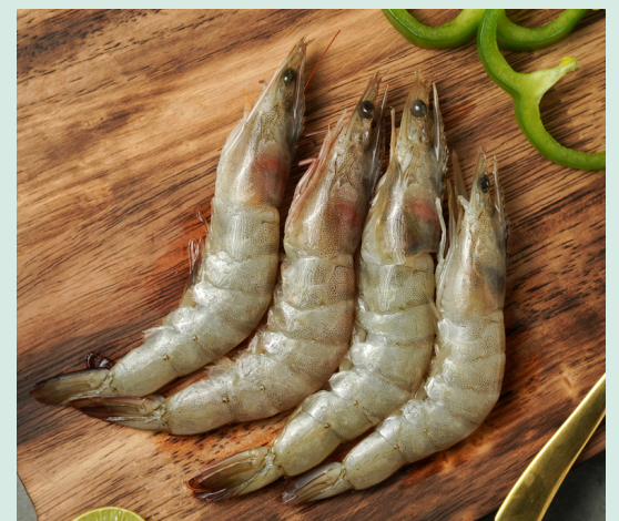
Head on Vannamei shrimp, IQF semi-IQF & block frozen